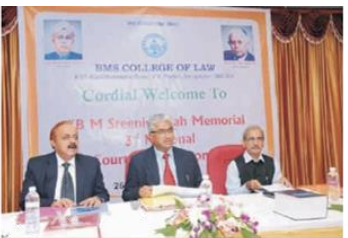
3 rd Moot Court Competition 26-28 Oct, 2017