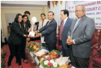
2 nd Moot Court Competition 10-12 March, 2016