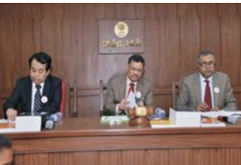
4 th Moot Court Competition 28-30 March, 2019