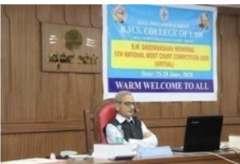
5 th Moot Court Competition 25-28 June, 2020