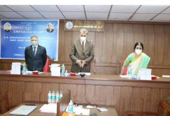
6 th Moot Court Competition 08-11 July, 2021