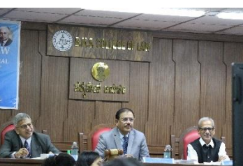
7 th Moot Court Competition 20-23 July, 2022