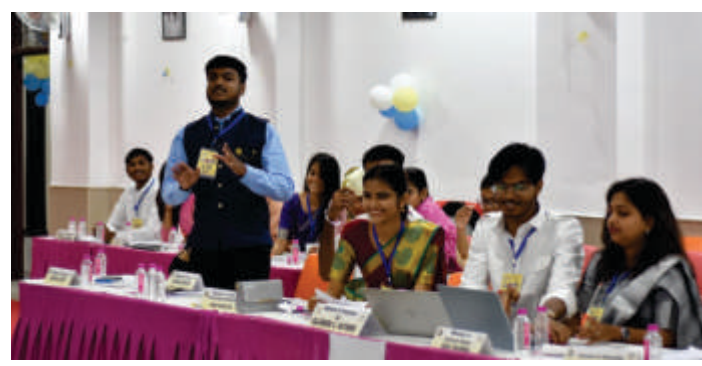
Youth Parliament, 2025