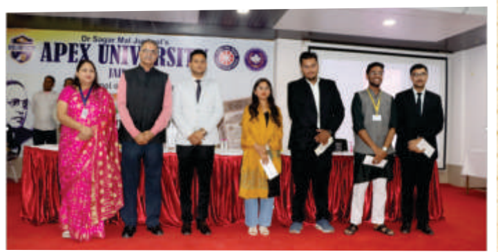
Mock Parliament, 2025