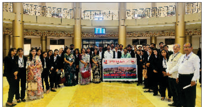
HIGH COURT JODHPUR