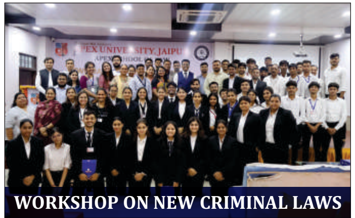
WORKSHOP ON NEW CRIMINAL LAWS