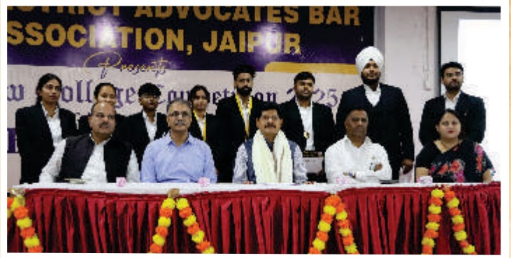
Inter Law College Competition, 2025