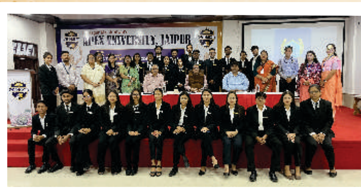
4th Dr. S.M. Juniwal Intra Moot Court Competition, 2026