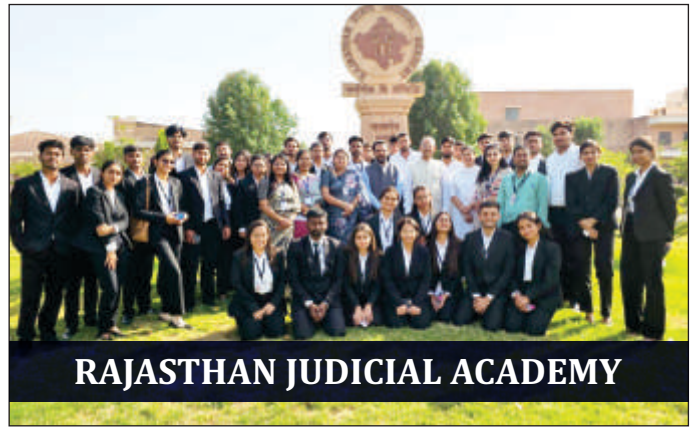
RAJASTHAN JUDICIAL ACADEMY