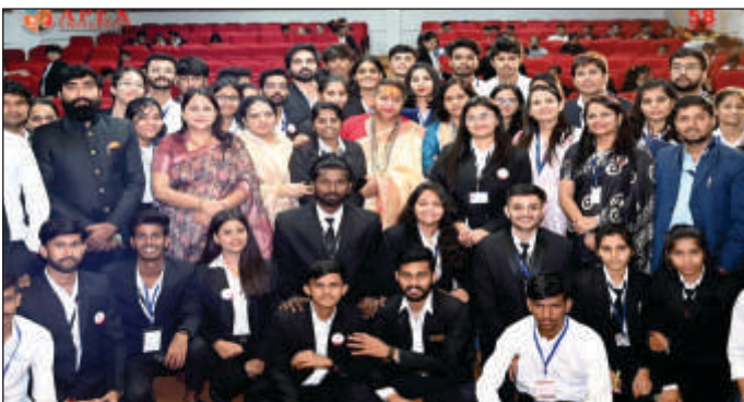
International Seminar on Human Rights of Transgenders